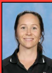
Ms Neighbour Preschool